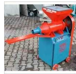
MANUAL DUNG LOG MAKING MACHINE