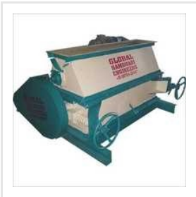
Industrial Crumbler Machine