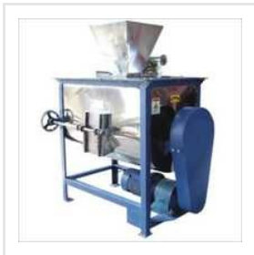
Mineral Mixer Machine