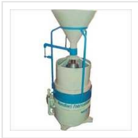
Vertical Pellet Mill