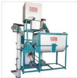
COMBO ANIMAL FEED PLANT

Automatic Dewatering Machine, Automatic Pulverizer, Automatic Vibro Sieve, Bio-Mass Pellet Plant, Cattle Feed Plant, Combo Animal Feed Plant, Combo Mash Feed Plant, Double Trippel Ribbon Mixer Machine, Floating Fish Feed Plant, Full Circle Hammer Mill Machine, Horizontal Pellet Mill, Industrial Crumbler Machine, Manual Dung Log Making Machine, Mineral Mixer Machine, Paddle Mixer Machine, etc.