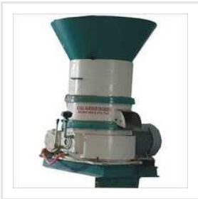
Straw Pellet Mill