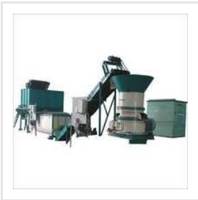
Straw Pellet Plant