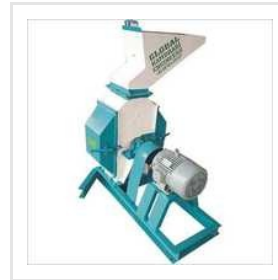
Full Circle Hammer Mill Machine