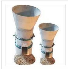
Potent Pellet Mill