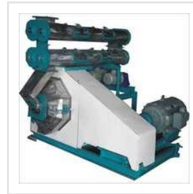
Horizontal Pellet Mill