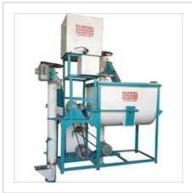
Combo Mash Feed Plant