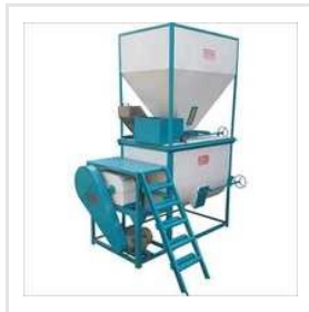
Paddle Mixer Machine