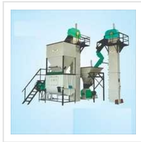
Poultry And Cattle Feed Mash Plant