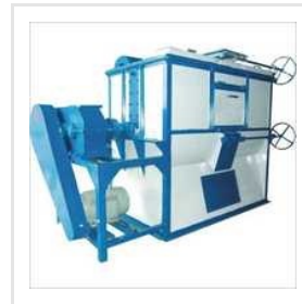
Double Trippel Ribbon Mixer Machine