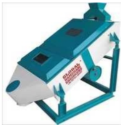
AUTOMATIC VIBRO SIEVE