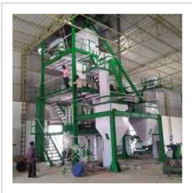
Automatic Dewatering Machine