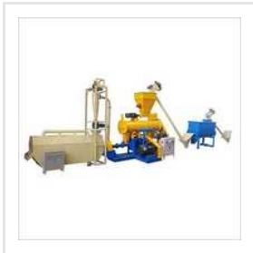
Floating Fish Feed Plant